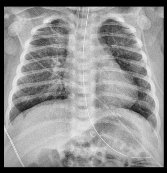
Chest, anterior-posterior, small pediatric with QuickEnhance