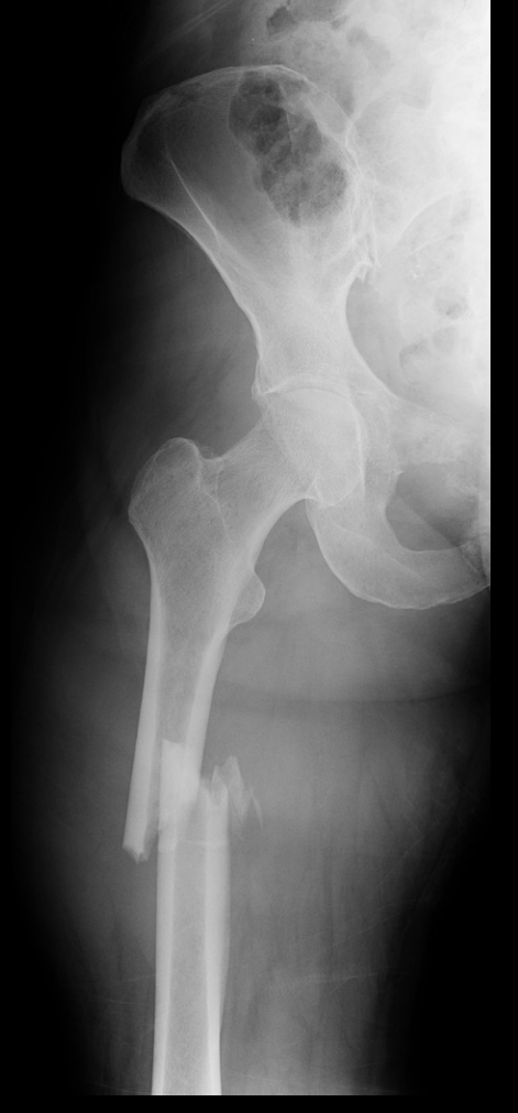
Hip, anterior-posterior, medium adult