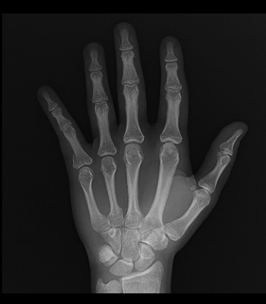
Hand, posterior-anterior, medium adult