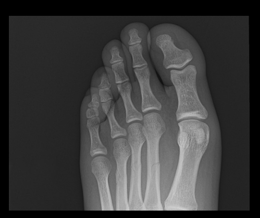
Foot, anterior-posterior, medium adult