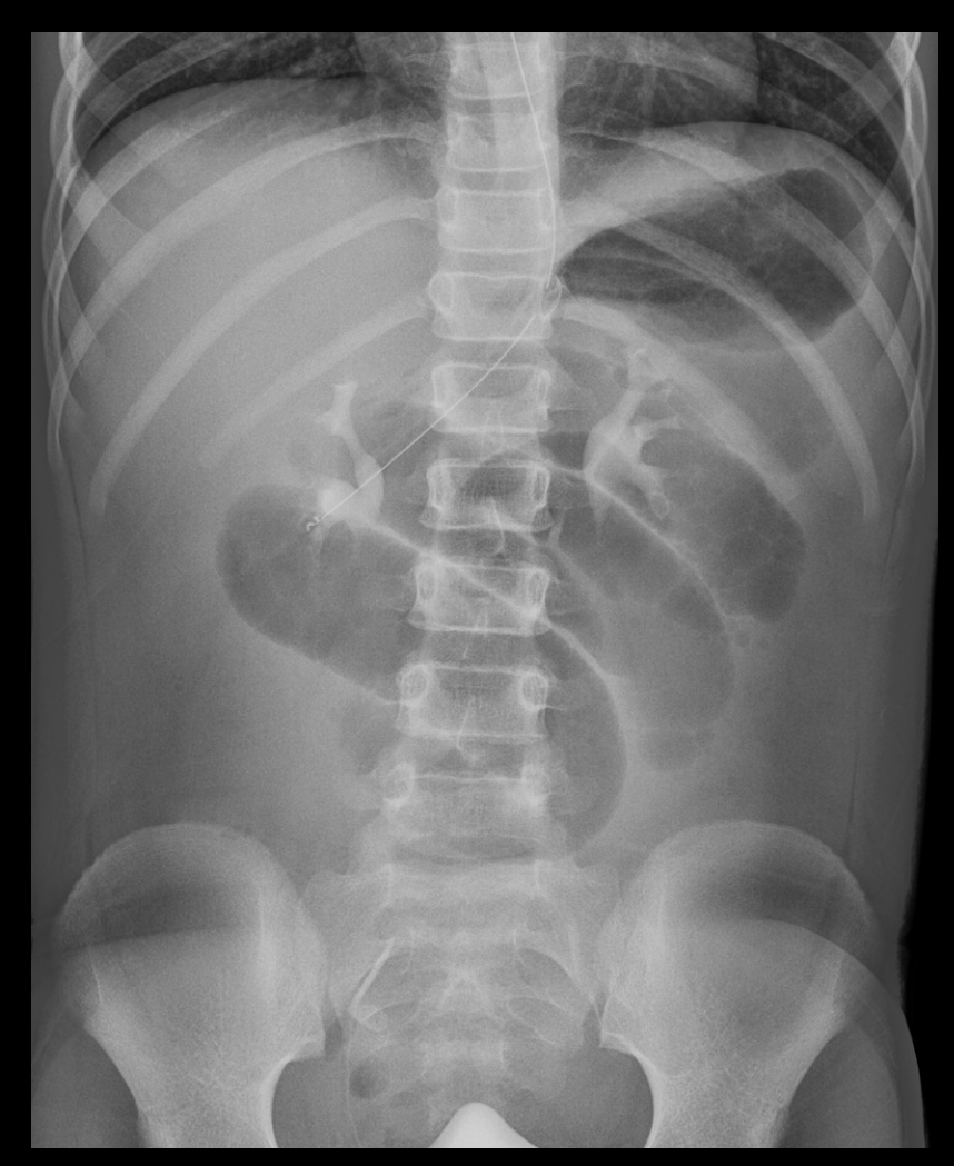
Abdomen, anterior-posterior, large pediatric