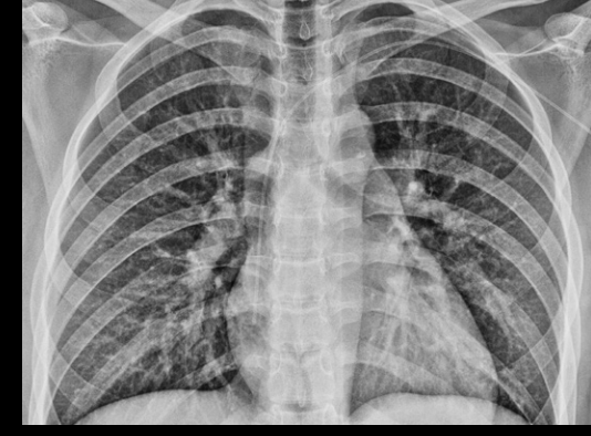
Chest, anterior-posterior, medium adult with QuickEnhance