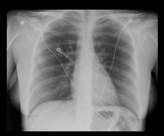
Chest, anterior-posterior, small adult