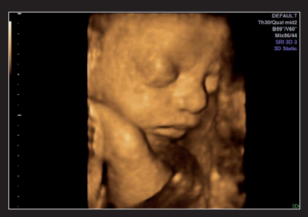
3D fetal face for enhanced clinical confidence using the RAB2-6-RS probe.