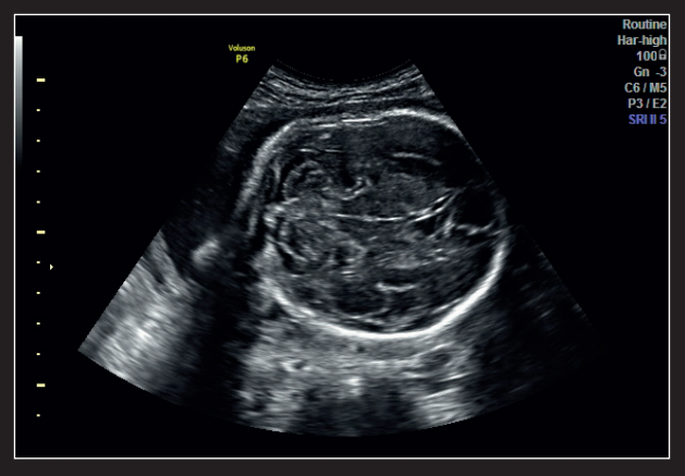
2D view of fetal brain using the RAB2-6-RS probe.