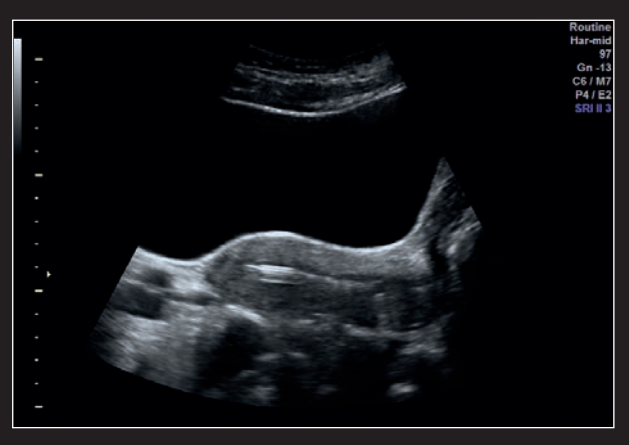
2D view of uterus using the 4C-RS probe.