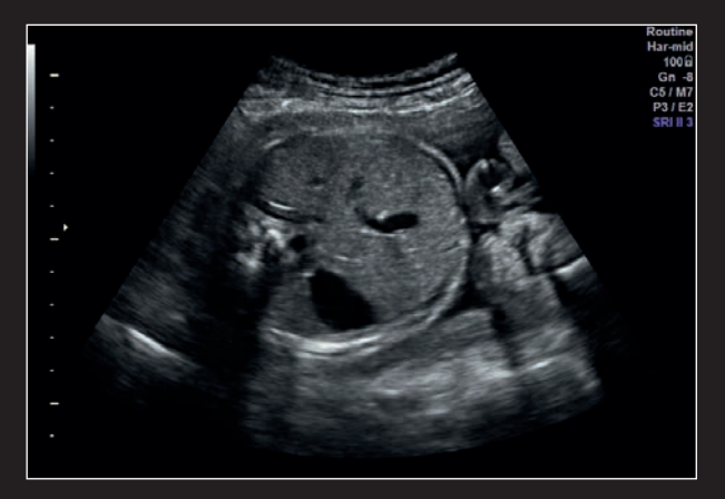
2D view of fetal abdomen using the RAB2-6-RS probe.