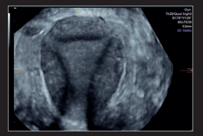
Uterus frontal view shown in 3D using the RIC5-9W-RS probe.